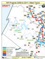
West Travis County