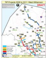
West Williamson County