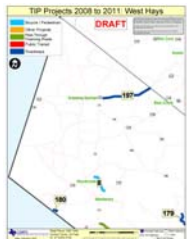
West Hays County