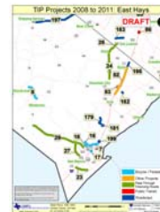
East Hays County