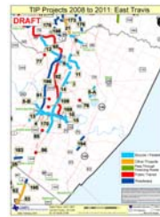
East Travis County